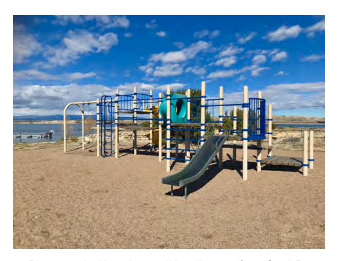
Playground with a short walking distance from Quail Run Pavilion

Website: http://cpw.state.co.us/placestogo/parks/boydlake/Pages/GroupPicnicArea.aspx