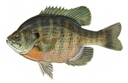
Bluegill Lepomis macrochirus