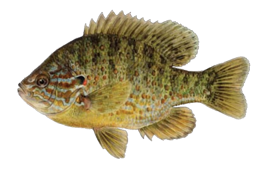
Pumpkinseed Sunfish Lepomis gibbosus