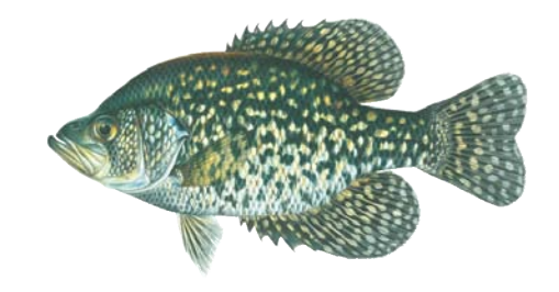
Black Crappie Pomoxis nigromaculatus