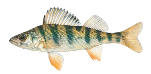
Yellow Perch Perca flavescens