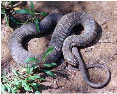
Northern Water Snake Nerodia sipedon