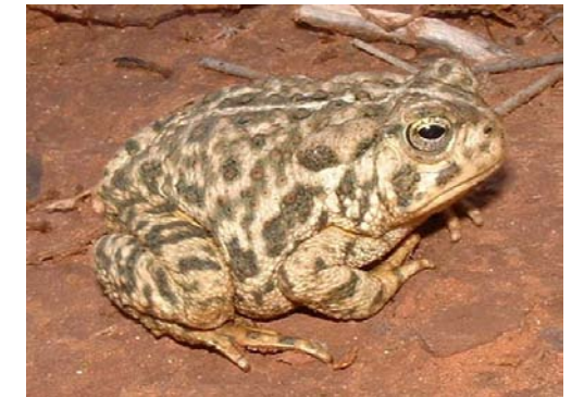
Woodhouse's Toad Bufo woodhousii