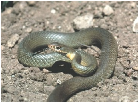
Yellow-Bellied Blue Race Coluber constrictor flaviventris