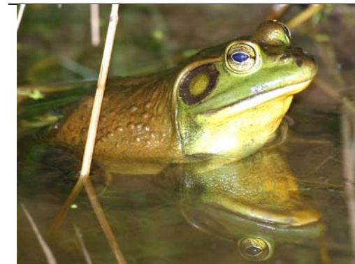
Bullfrog Rana catesbeiana