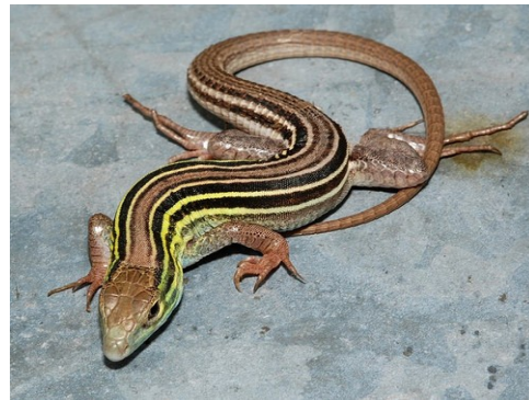
Six-lined Racerunner Cnemidophorus sexlineatus