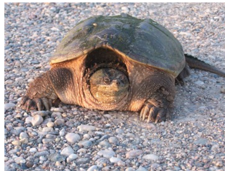
Common Snapping Turtle Chelydra serpentina