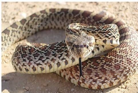
Bull Snake/ Gopher Snake Pituophis catenifer sayi