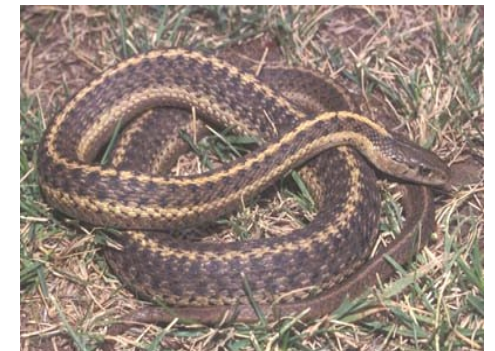
Western Terrestrial Garter Snake