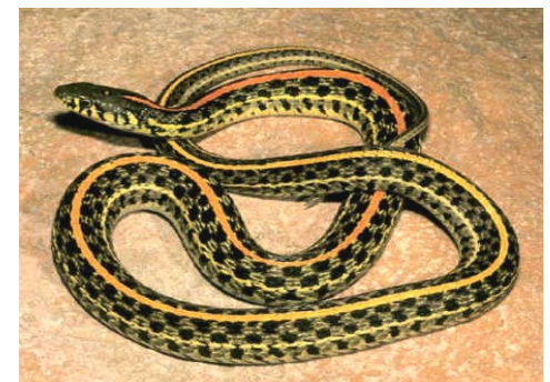
Plains Garter Snake