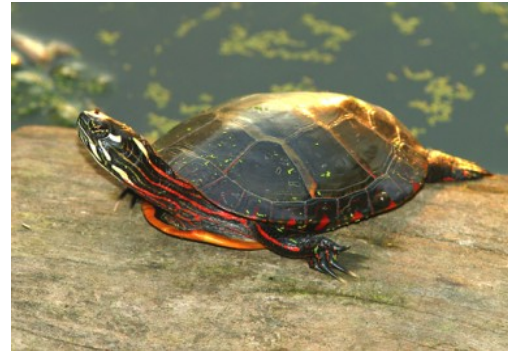
Painted Turtle Chrysemys picta