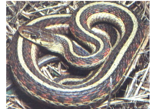
Common Garter Snake