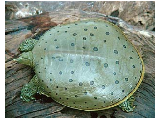
Spiny Softshell Turtle Apalone spinifera