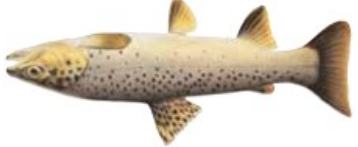
BROWN TROUT Spotting patterns made up of black spots; red-orange spots inside