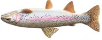
RAINBOW TROUT Black spots on a light body, red stripe along sides