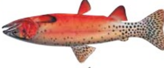
CUTTHROAT (NATIVE) TROUT Crimson slash on either side of the throat beneath the lower jaw; he gowls spotting towards the tail