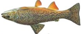
TIGER TROUT Cross between a brown trout and a brook trout; prominent stripes on body, resembling a tiger